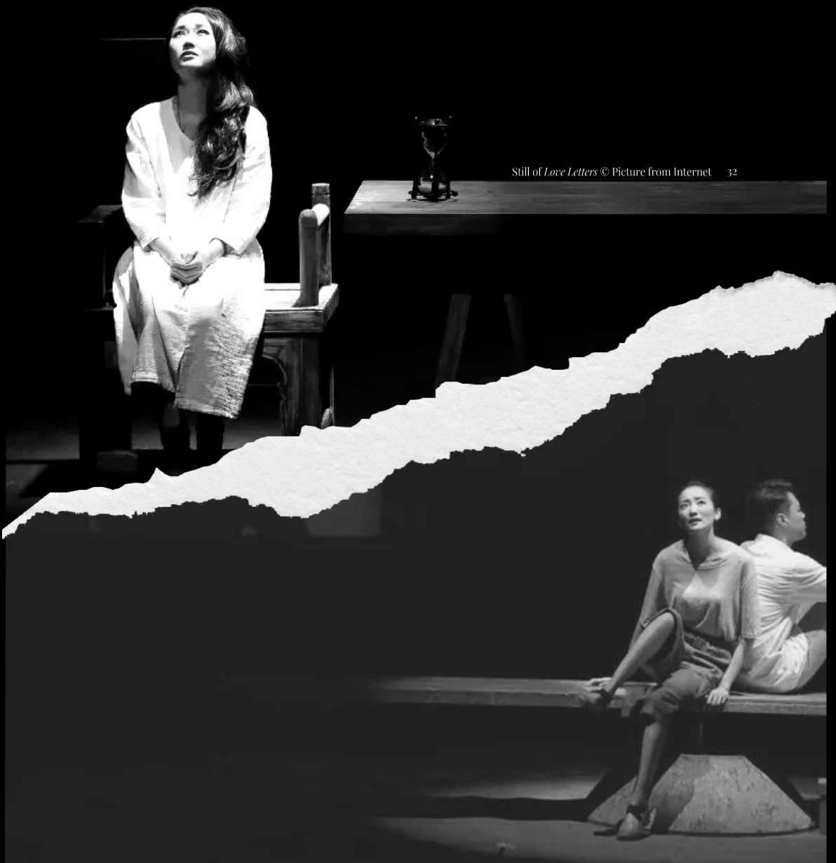
Still of Love Letters 32